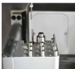
10 tool magazines