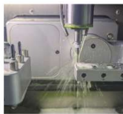
Integrated water level monitoring